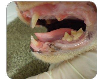
Red marks on the gums are a sign of gum disease

FORLs (resorptive lesions) -These are very painful small holes that appear in the teeth of some cats. It is not clear why they occur but teeth will always need attention if they are present.